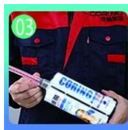
03 Open & Watch, both sides can extruded meanwhile.