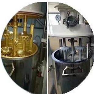
Batching Production Line