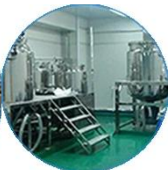
Creaming Machine Line