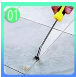
01 Clean the tiles and keep it dry.