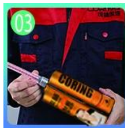
03 Open & Watch, both sides can extruded meanwhile.