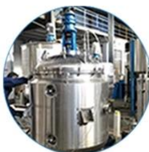
Creaming Machine Line