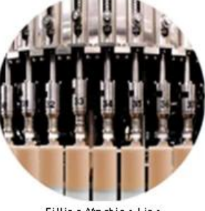
Filling Machine Line