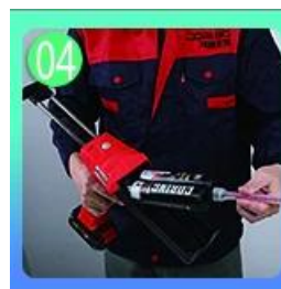
04 Screw on the nozzle, put on the grout gun.