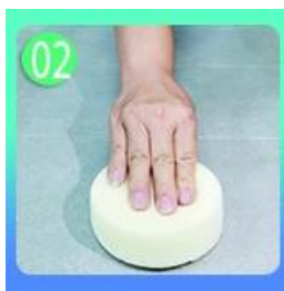
02 Polish with tile wax except the glazed tile.