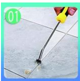
01 Clean the tiles and keep it dry.