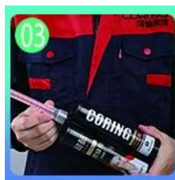
03 Open & Watch, both sides can extruded meanwhile.