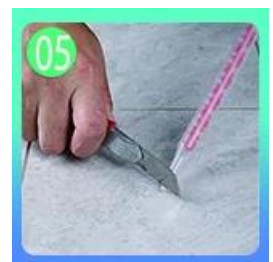
05 Inclined cut the top of the nozzle in 45°.