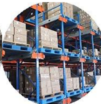
Real Material Stock