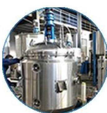
Creaming Machine Line