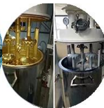
Batching Production Line