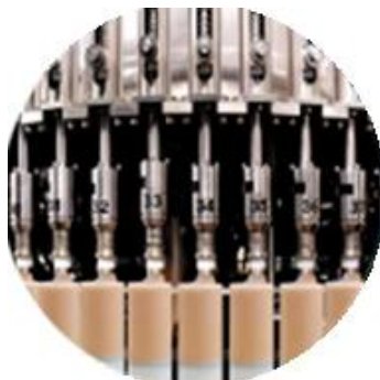
Filling Machine Line