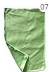
07 Scouring Pad