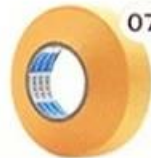
07 Masking Tape