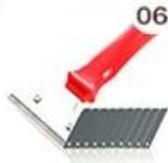
06 Perching Knife