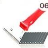
06 Perching Knife