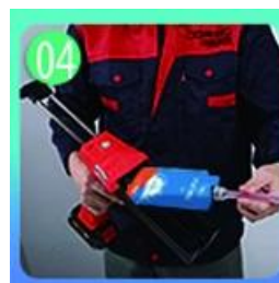
04 Screw on the nozzle, put on the grout gun.