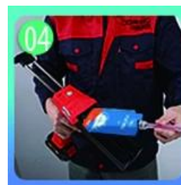
04 Screw on the nozzle, put on the grout gun.