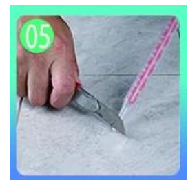
05 Inclined cut the top of the nozzle in 45°.