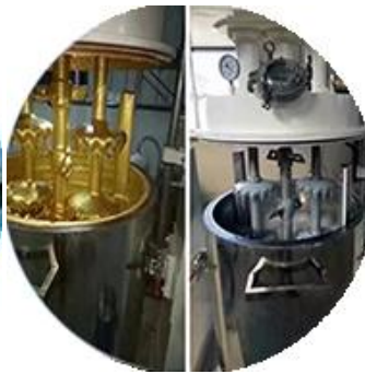
Batching Production Line