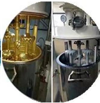
Batching Production Line