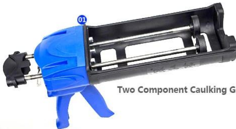
Two Component Caulking Gun