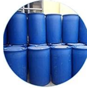
Real Material Stock