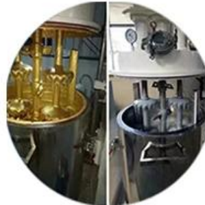
Batching Production Line