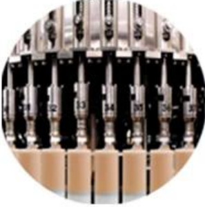
Filling Machine Line