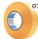
07 Masking Tape