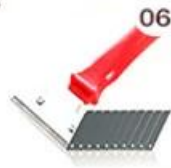
06 Perching Knife