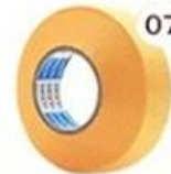
07 Masking Tape