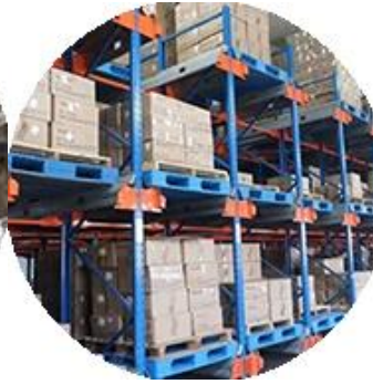
Real Material Stock