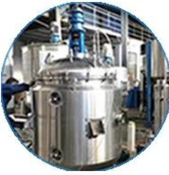
Creaming Machine Line