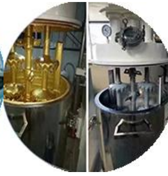
Batching Production Line