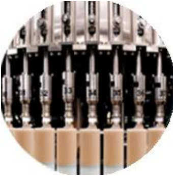
Filling Machine Line