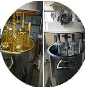
Batching Production Line