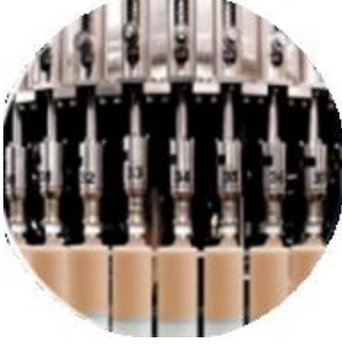
Filling Machine Line