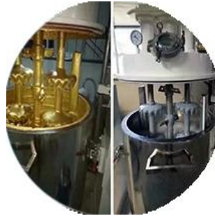
Batching Production Line