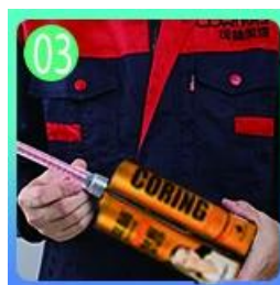
03 Open & Watch, both sides can extruded meanwhile.