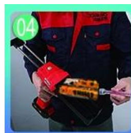
04 Screw on the nozzle, put on the grout gun.