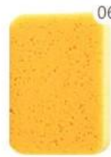
06 The sponge