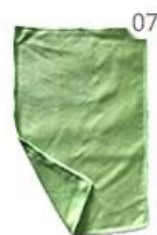
07 Scouring Pad