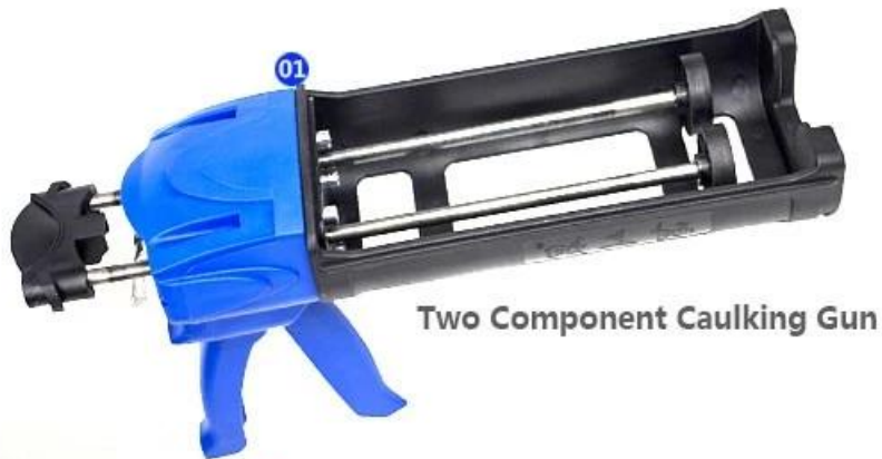
Two Component Caulking Gun