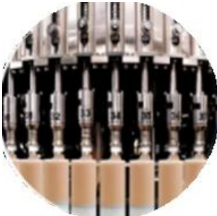
Filling Machine Line