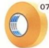
07 Masking Tape