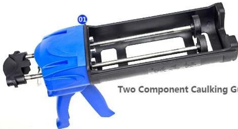
Two Component Caulking Gun