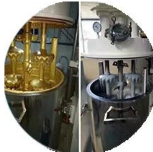
Batching Production Line