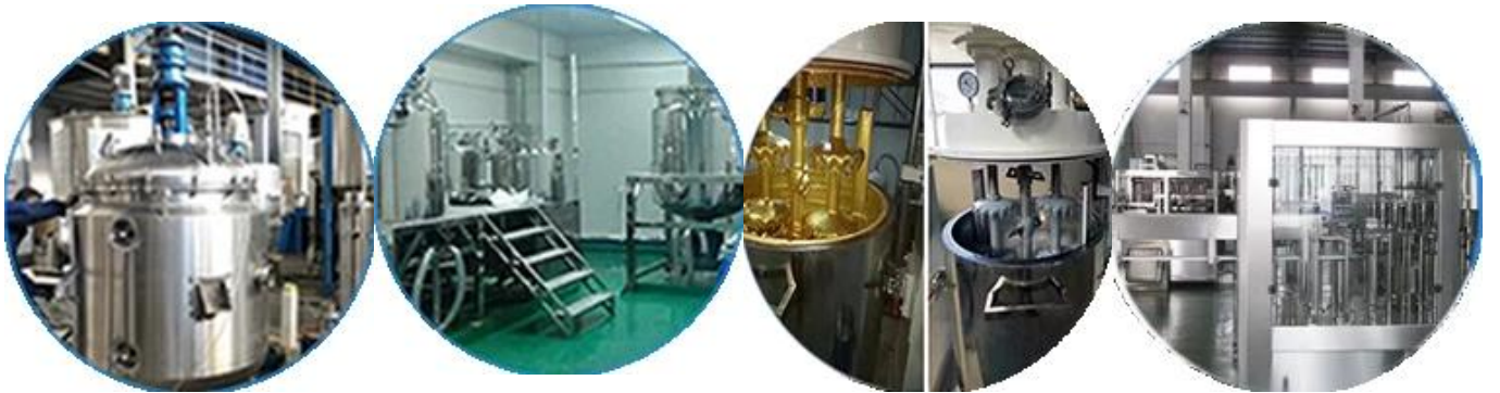
Creaming Machine Line