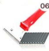
06 Perching Knife