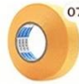
07 Masking Tape