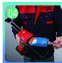
04 Screw on the nozzle, put on the grout gun.