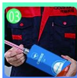
03 Open & Watch, both sides can extruded meanwhile.