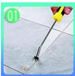
01 Clean the tiles and keep it dry.