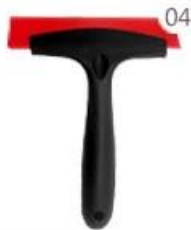
04 Rainbow Scraper