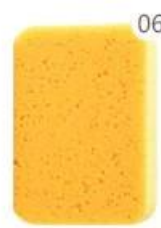
06 The sponge