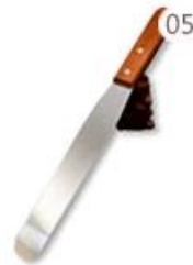
05 Stirring Knife