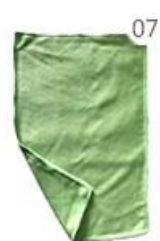
07 Scouring Pad