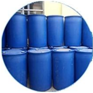
Real Material Stock