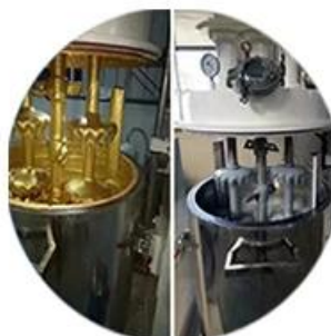
Batching Production Line