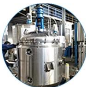
Creaming Machine Line