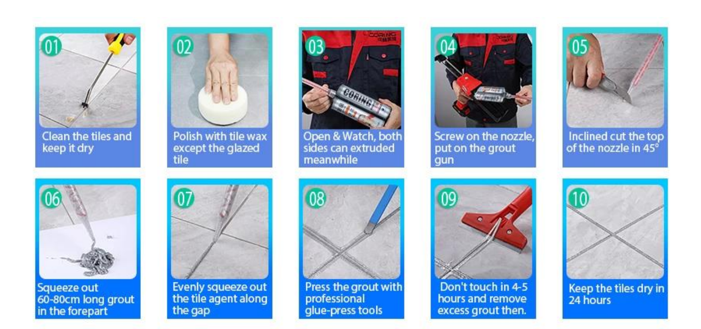
Professional Joint-Pressing Tool