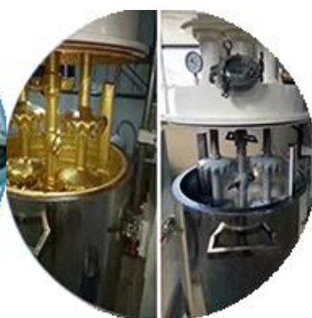
Batching Production Line