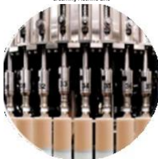
Filling Machine Line