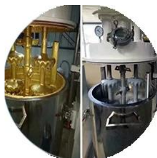
Batching Production Line